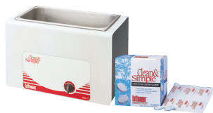
Clean&Simple™ Ultrasonic Cleaners and Tablets

Documents: date, time, temperature, pressure.