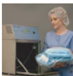
FREE OPERATOR TRAINING