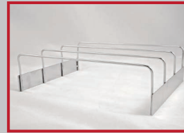
Small Cassette Rack