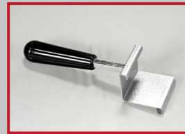
Tray Removal Tool