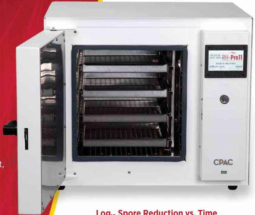
Log 10 Spore Reduction vs. Time Wrapped and Unwrapped Sterilization Cycles

HVHA Sterilization is activated by a simple push of a cycle button. Since there is no steam pressure, the complete cycle from door closed to door open is 20 minutes for wrapped instruments. Each cycle is documented with infinite storage for easy retrieval at any time via a USB Flash Drive. Since HVHA sterilization operates at very low wattage, you can leave the system running all day with very little energy cost.