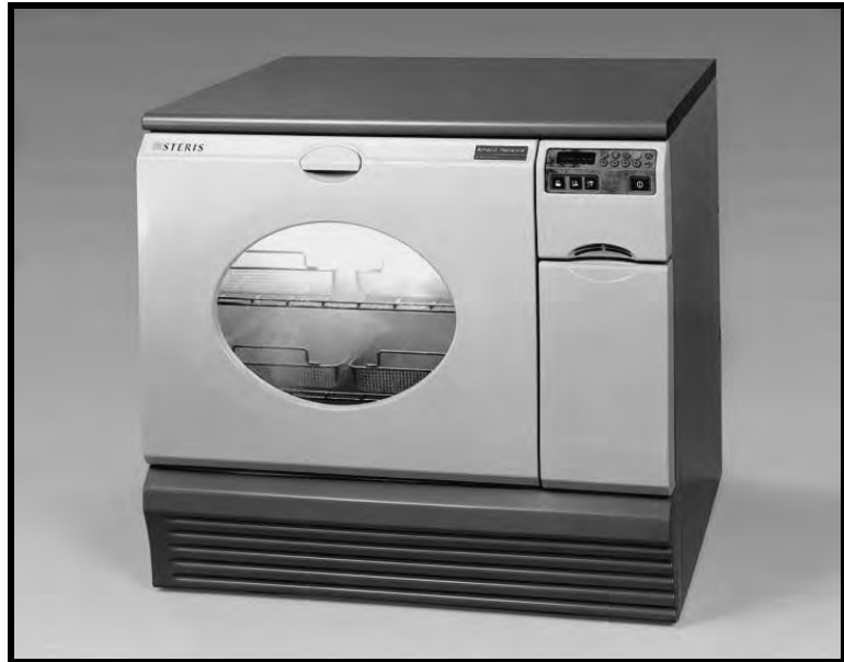
Shown with Countertop (Typical only - some details may vary.)

A printer (see Accessories) can be installed to record and monitor cycles and cycle parameters.